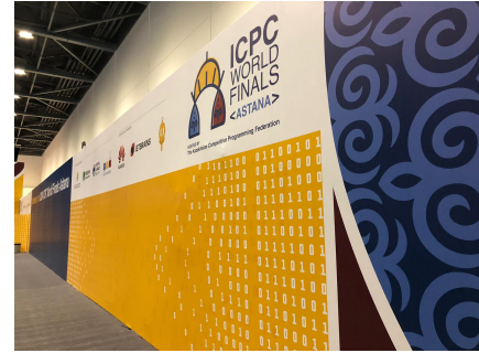
Billboards in the contest area

There are n wonderful sponsors in total, so to be fair, we would like to give each of them 1/n of the total area of the billboard. However, this is complicated by the fact that each marvelous sponsor potentially values sections of the billboard differently. For example, some sponsors want to put their ads near the entrance of the contest area, which may be at the corner where all contestants are guaranteed to see them when they enter. On the other hand, some sponsors may just want to put their ads in the middle, which is more likely to be broadcast in the live stream. (Don't ask us what happens if the entrance is at the middle! It's just an example.)