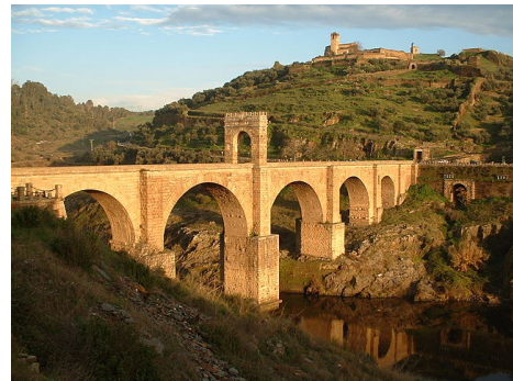
Example of a Roman arch bridge.

What connects us all? Well, it is often bridges. Since ancient times, people have been building bridges for roads, for trains, for pedestrians, and as aqueducts to transport water. It is humanity’s way of not taking inconvenient geography for an answer.