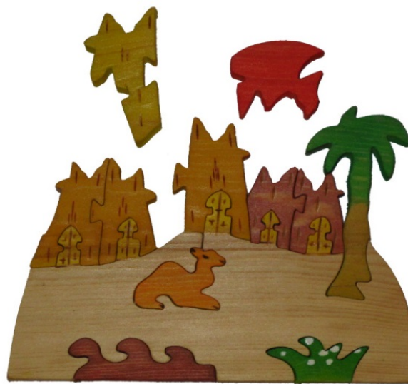
Figure H.1: The judge's wooden puzzle.

During last year's ACM ICPC World Finals in Marrakesh, one of the judges bought a pretty wooden puzzle depicting a camel and palm trees (see Figure H.1). Unlike traditional jigsaw puzzles, which are usually created by cutting up an existing rectangular picture, all the pieces of this puzzle have been cut and painted separately. As a result, adjacent pieces often do not share common picture elements or colors. Moreover, the resulting picture itself is irregularly shaped. Given these properties, the shape of individual pieces is often the only possible way to tell where each piece should be placed.