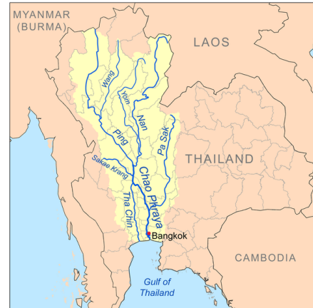
The Chao Phraya River System.

A simplified model of this river system is shown in Figure F.1, where the smaller red numbers indicate the lengths of various sections of each river. The point where two or more rivers meet as they flow downstream is called a confluence . Confluences are labeled with the larger black numbers. In this model, each river either ends at a confluence or flows into the sea, which is labeled with the special confluence number 0. When two or more rivers meet at a confluence (other than confluence 0), the resulting merged river takes the name of one of those rivers. For example, the Ping and the Wang meet at confluence 1 with the resulting merged river retaining the name Ping. With this naming, the Ping has length 658 km while the Wang is only 335 km. If instead the merged river had been named Wang, then the length of the Wang would be 688 km while the length of the Ping would be only 305 km.